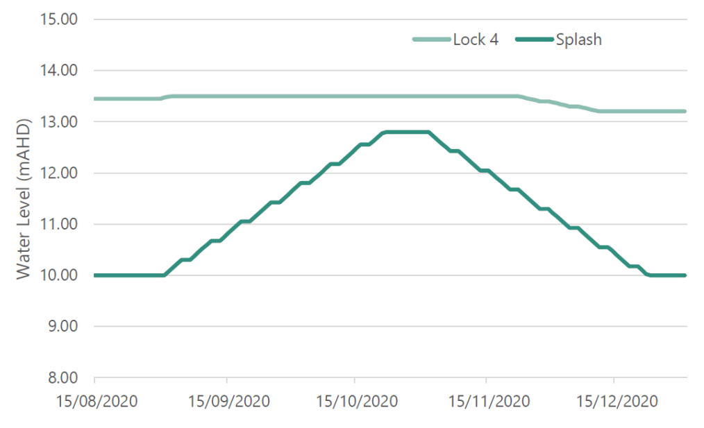
Figure 1: Operating hydrograph for first operation at Katarapko Floodplain up to 12.8 m AHD

The event will commence in the first week of September 2020 and conclude on approximately 21 December 2020. The operating hydrograph (Figure 1) shows how the water levels at the main regulator (known as The Splash) and Lock 4 will be raised.